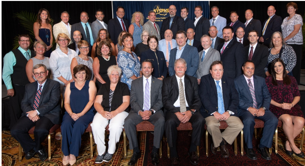
2018-2019 NYSPHSAA Central Committee, Staff and Officers